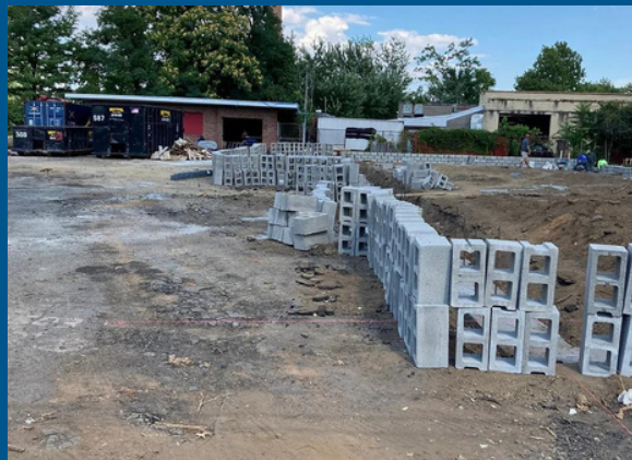
Above: Pictures of the demolition of the VFW Post 2640 building.