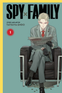
Young Adult Fiction